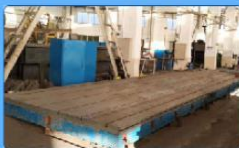
High precision grinding platform( 3M*6M)