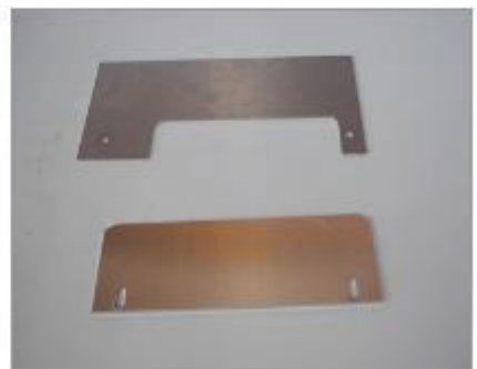
China high precision OEM sheet metal fabrication