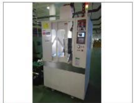
Equipment shell Sheet Metal Fabrication