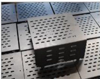
High precise sheet metal fabrication