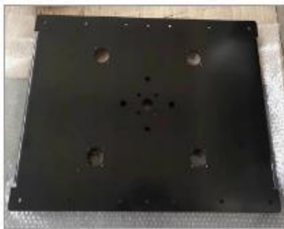
Conveyor accessories-Sheet Metal Parts