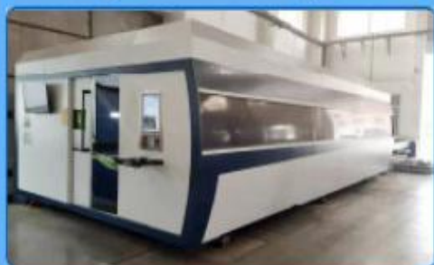
CNC Laser Cutting Machine