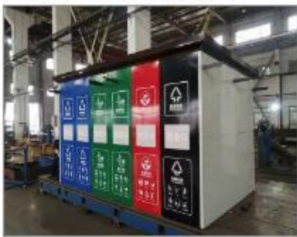
Metal processing-trash can