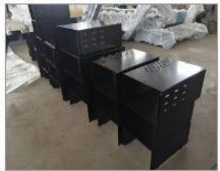
OEM Laser Cutting Parts Sheet Metal