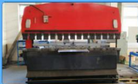
CNC Bending machine