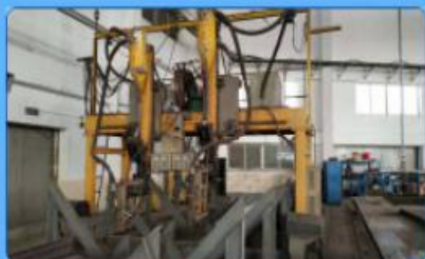
Submerged Arc Welding machine