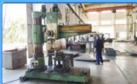
Radial Drilling machine