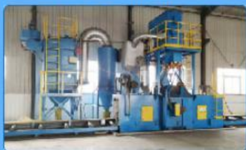
Shot blasting machine