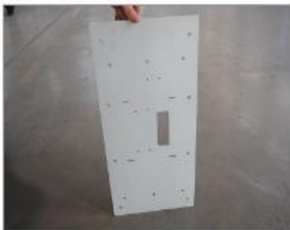
Sheet Metal Parts China- Factory custom