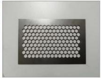
Custom Sheet Metal Parts