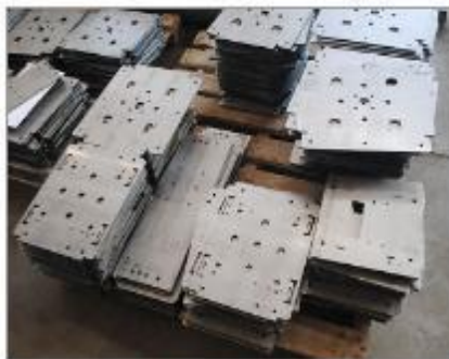
Laser Cutting Service-Custom metal accessories