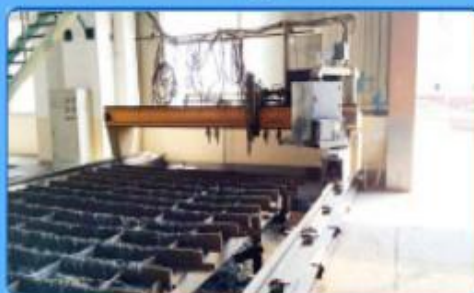
Radial Drilling machine