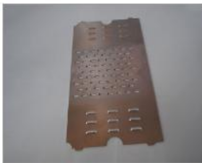
Custom stainless steel sheet fabrication