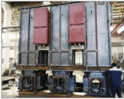
Sheet Metal Machining China